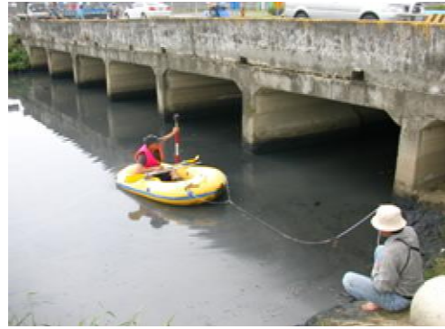
Fig. 2 Channel survey work on No Name Creek